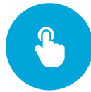
Identify Workflow Roadblocks

Expect a detailed evaluation of your current processes, identifying inefficiencies, redundancies, and opportunities for improvement. We will work to develop and implement standardized processes that align with your business goals. The result will be increased operational efficiency, enhanced scalability, and improved communication across teams.